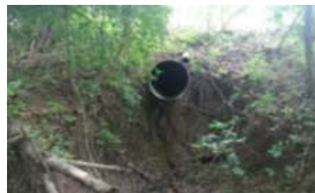
Figure B.1. The above outfalls are examples of different types of outfalls that must be identified on MS4 maps and included in the permittee’s screening program. Areas with highly developed land uses (e.g., commercial business complexes, aging infrastructure) have a greater potential to pollute and must be prioritized. Structural stability and erosion concerns must also be identified as part of an effective IDDE program.